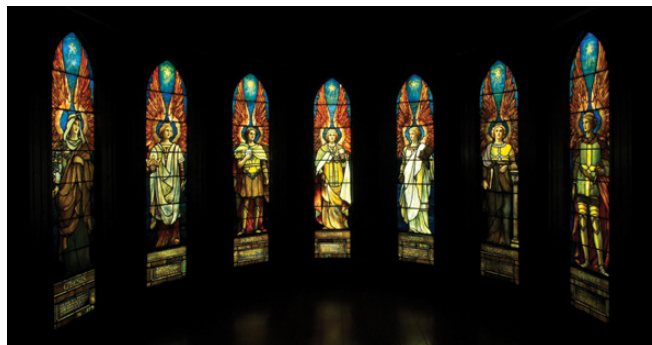
Seven Windows, Louis Comfort Tiffany, about 1902, leaded stained glass. Exhibition organized by In Company with Angels.