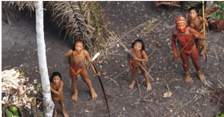
The photos were taken by Brazil's National Indian Foundation and were given to Survival International, it said.