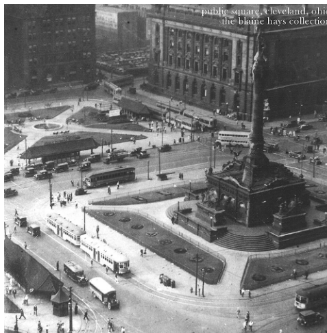
Public Square, Cleveland, Ohio

She makes the point that though beauty was supremely important for Burnham, it was not so in the same way as it was in the art-for-art's sake school of aesthetics. Rather it was beauty with a purpose—a use, in Swedenborg's terminology—namely, to morally uplift the souls of people who beheld it. She recounted that on the day of the World's Fair when people of Chicago from all classes of society were given free admission, Burnham witnessed the truth of his hypothesis. The masses filed in and were seen to fall en masse into stunned silence as their hearts drank in through their eyes the heavenly beauty that had been prepared for them. The generous philanthropy of Daniel Burnham was boundless and almost difficult to grasp from the standpoint of the material age in