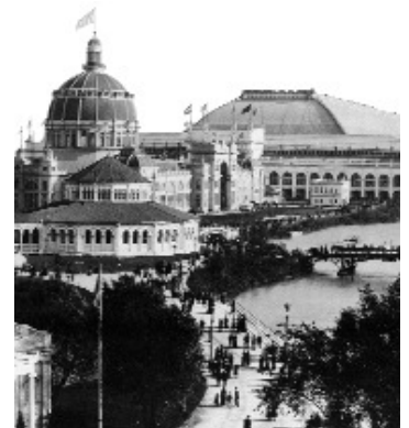
The 1893 World's Columbian Exposition was one of the most pivotal moments in American cultural history. Burnham, as Director of Works, envisioned a beautiful city and oversaw its construction.

B urnham was born in Henderson, New York and raised in Chicago, Illinois. His parents brought him up under the teachings of the Swedenborgian Church of New Jerusalem, which ingrained in him the strong belief that man should strive to be of service to others.